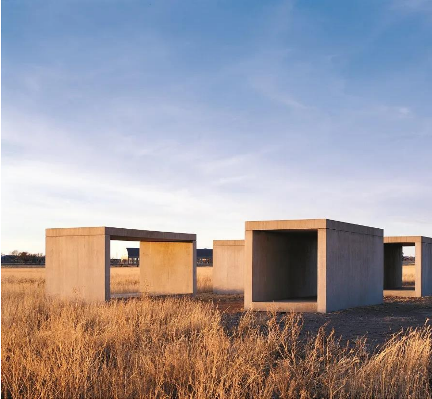
Donald Judd, 15 works in concrete, Marfa, Photo Credit F Holzherr, Photo Courtesy of The Chinati Foundation